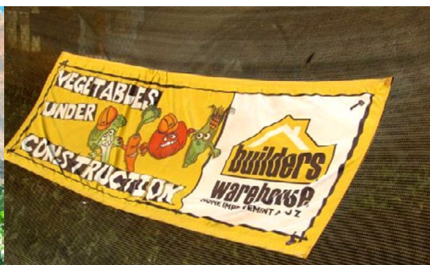
Builders Warehouse has set up veggie tunnels near schools creating a nationwide sustainable food production project