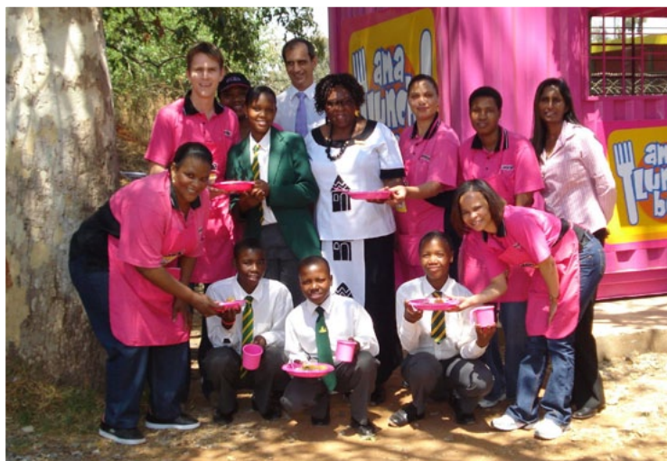
A Game amaLunchbox school kitchen

Once a sustainable food source is in place, Massmart will expand its AmaLunchbox and Econo-Kitchen programmes (see details on Massmart's website), which provide either container kitchens in urban environments or purpose built kitchens in the rural areas for the preparation of hygienic, healthy